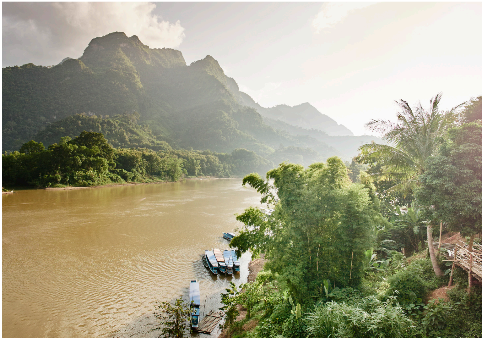
Above: view from the bridge in the village of Nong Khiaw, north of the city, where you can meet the weavers making traditional Laotian textiles