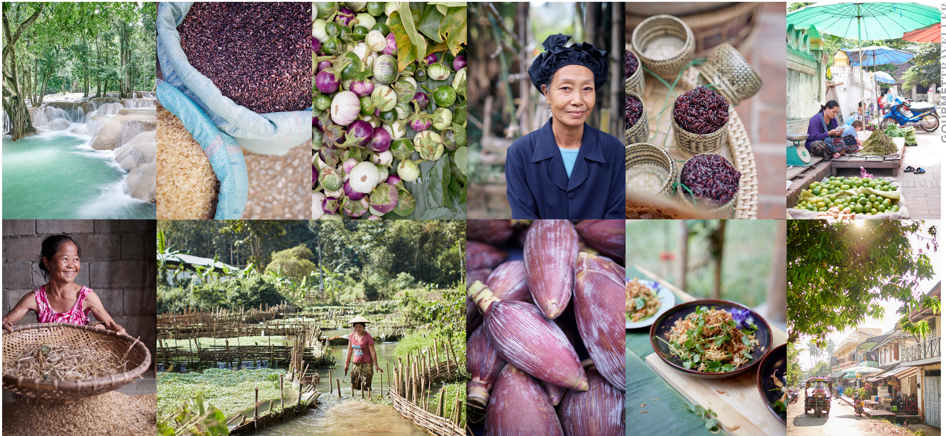
Clockwise, from top left: Tad Sae Waterfalls; grains at the Morning Market; a local aubergine variety; a cookery school teacher; sticky rice; Morning Market stalls;