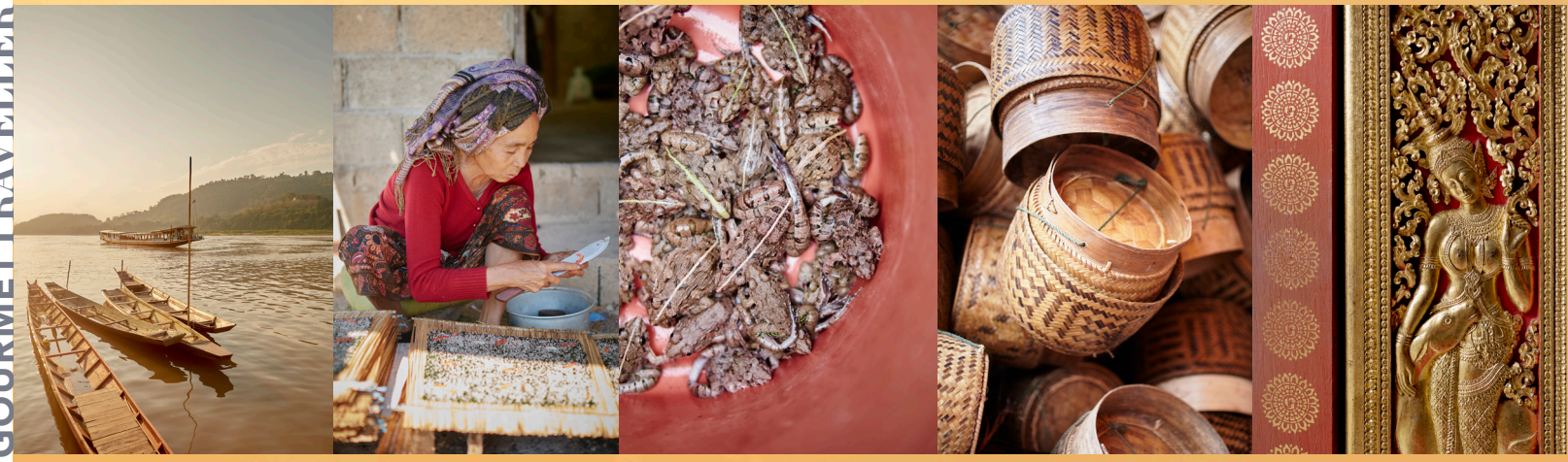
Clockwise, from above left: two rivers are integral to city life; preparing kaipen ; frogs at the market; local steamers; ornate Wat Xieng Thong; sunset over the Mekong