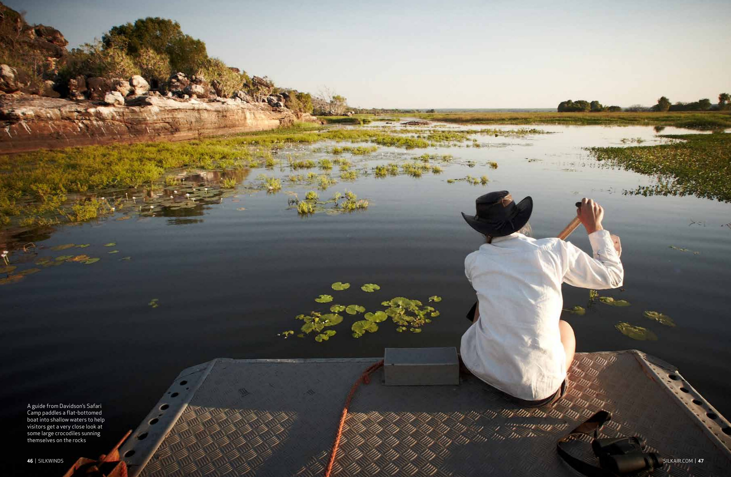
A guide from Davidson's Safari Camp paddles a flat-bottomed boat into shallow waters to help visitors get a very close look at some large crocodiles sunning themselves on the rocks